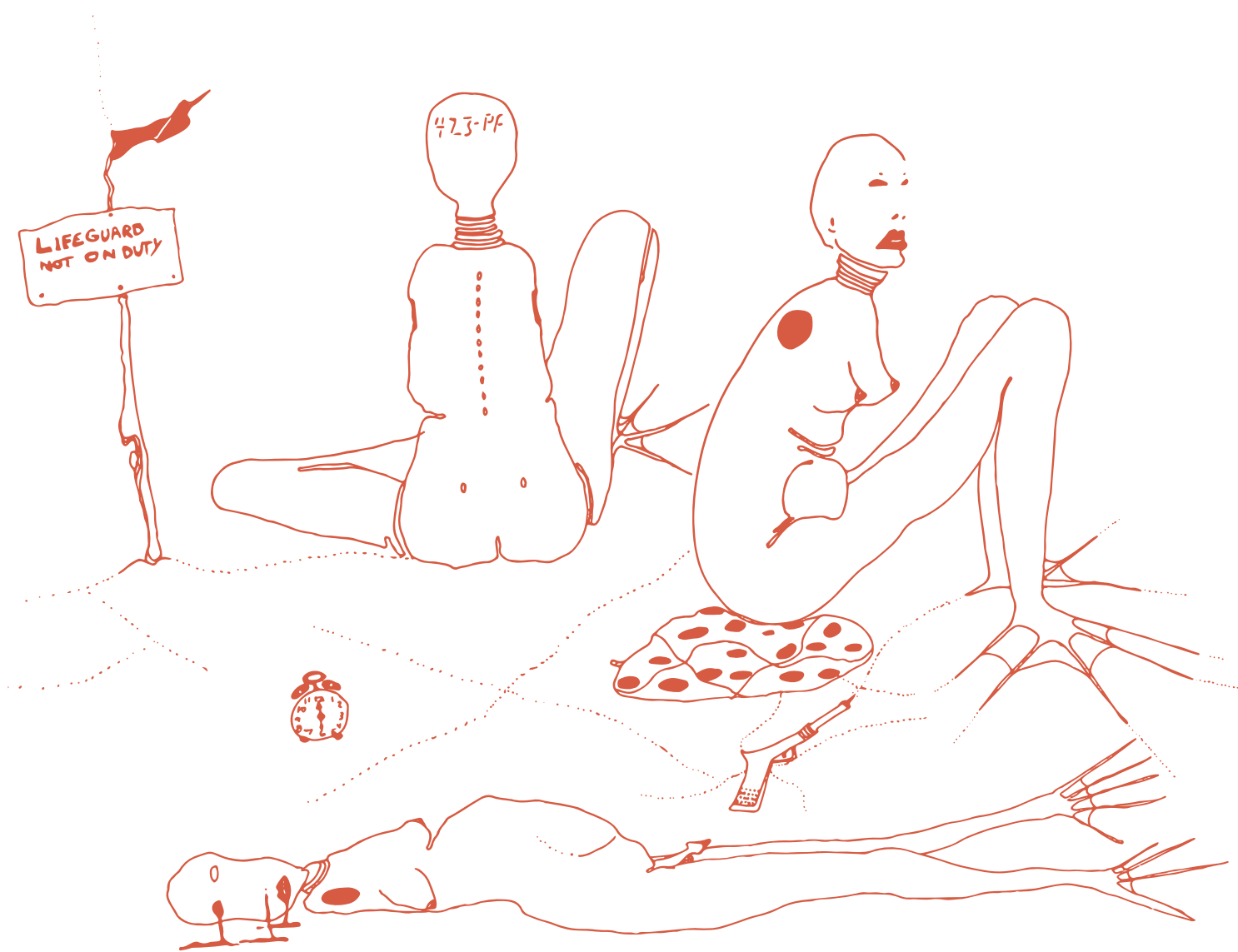
Clockwise from top left: Yerrie Choo, sometimes the stain is a nag , 2022 LONE HEART, NEVERENDING BATTLE , 2020 Kitty Brophy, At The Beach , 1979